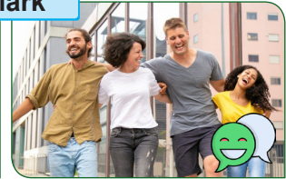
go out with friends