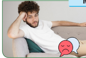
stay at home