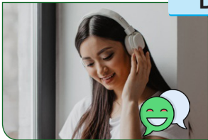
listen to music