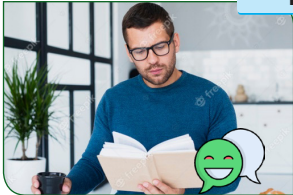
read a book