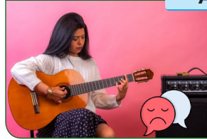
play an instrument