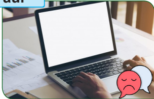
surf the Internet